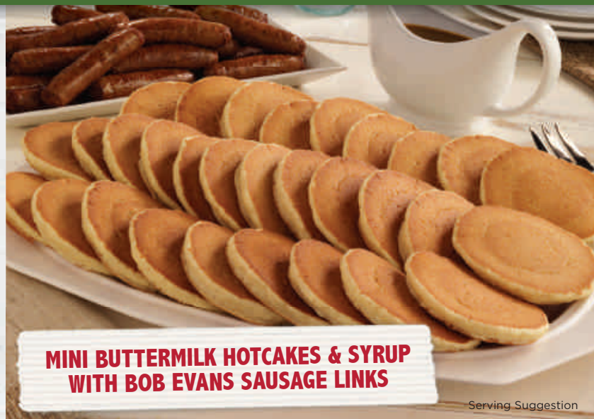
MINI BUTTERMILK HOTCAKES & SYRUP WITH BOB EVANS SAUSAGE LINKS