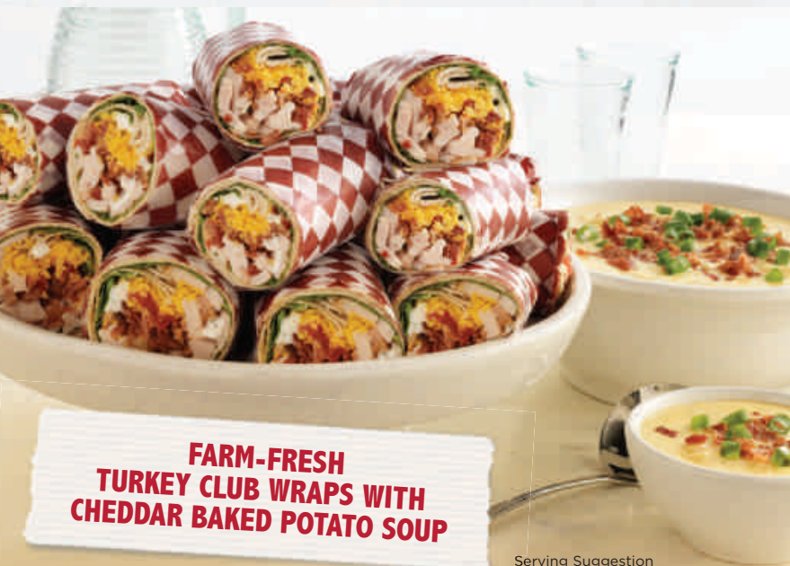
FARM-FRESH TURKEY CLUB WRAPS WITH CHEDDAR BAKED POTATO SOUP

Check out our Carry Out menu for Family-Size Meals with portions that serve 4!