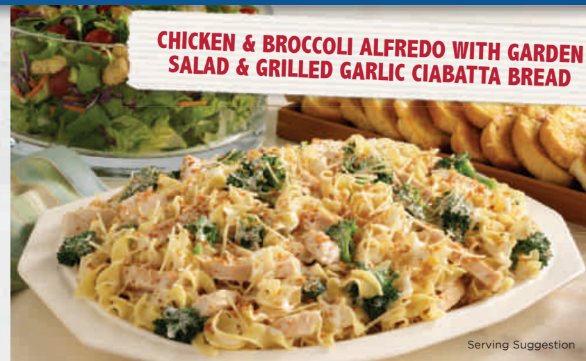
CHICKEN & BROCCOLI ALFREDO WITH GARDEN SALAD & GRILLED GARLIC CIABATTA BREAD